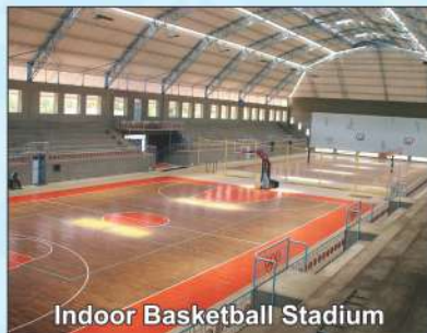
Indoor Basketball Stadium