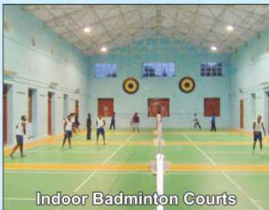
Indoor Badminton Courts