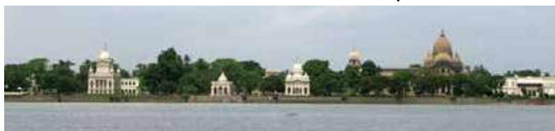
HEADQUARTERS: PANORAMIC VIEW FROM GANGES

RAMAKRISHNA MATH AND RAMAKRISHNA MISSION: Ramakrishna Math and Ramakrishna Mission are twin organizations forming the core of a worldwide spiritual movement (known as Ramakrishna Movement or Vedanta Movement), which aims at harmony of religions, harmony of the East and the West, harmony of the ancient and the modern, spiritual fulfilment, all-round development of human faculties, social equality, and peace for all humanity, without any distinctions of creed, caste, race or nationality.