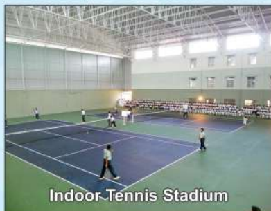
Indoor Tennis Stadium