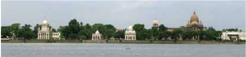
HEADQUARTERS: PANORAMIC VIEW FROM GANGES

RAMAKRISHNA MATH AND RAMAKRISHNA MISSION: Ramakrishna Math and Ramakrishna Mission are twin organizations forming the core of a worldwide spiritual movement (known as Ramakrishna Movement or Vedanta Movement), which aims at harmony of religions, harmony of the East and the West, harmony of the ancient and the modern, spiritual fulfilment, all-round development of human faculties, social equality, and peace for all humanity, without any distinctions of creed, caste, race or nationality.