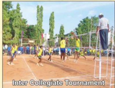
Inter Collegiate Tournament