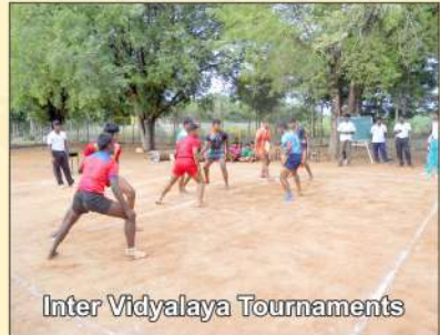
Inter Vidyalaya Tournaments