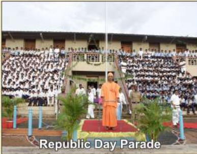
Republic Day Parade