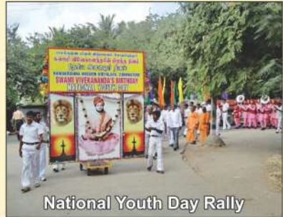
National Youth Day Rally