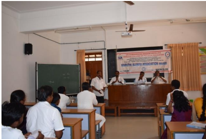
Alumni sharing suggestions for quality enhancement of the college

Maruthi Alumni Association (MAASS) meeting was held in the campus on 10.02.2019. About 10 Alumni with their family members participated in the meeting.