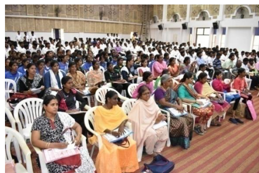
Participants during the inaugural function