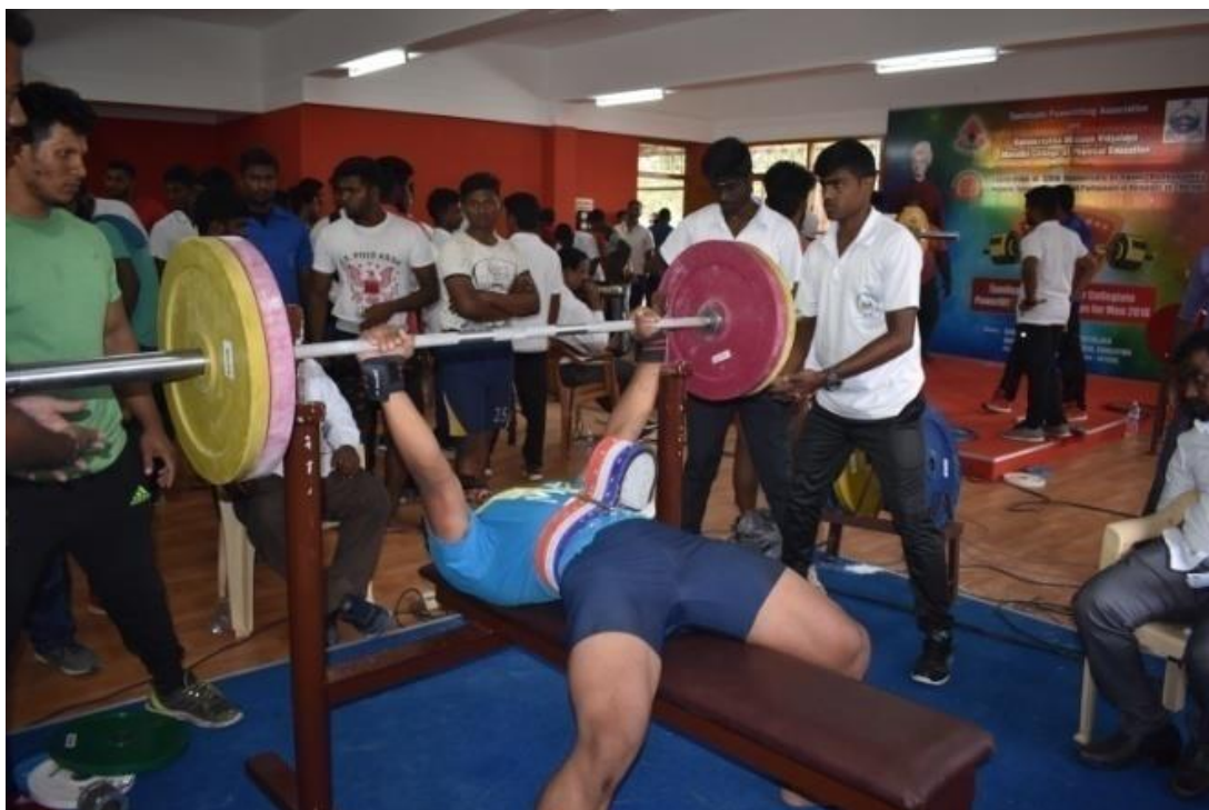
Participants in Action in the Tamil Nadu State 1 st Inter- Collegiate Powerlifting Championship (Competition) for Men on 16.12.2018