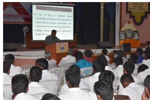
Participants during Scientific Session