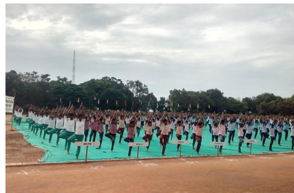
Students' demonstrating yogasanas