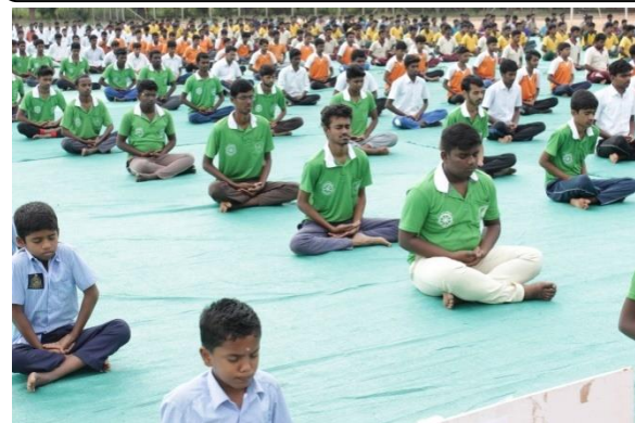
Students' demonstrating yogasanas