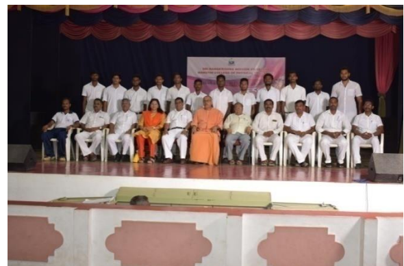
Group Photo of Achievers Day Function