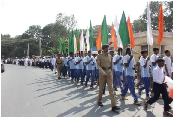
Students during the National Youth Day Rally