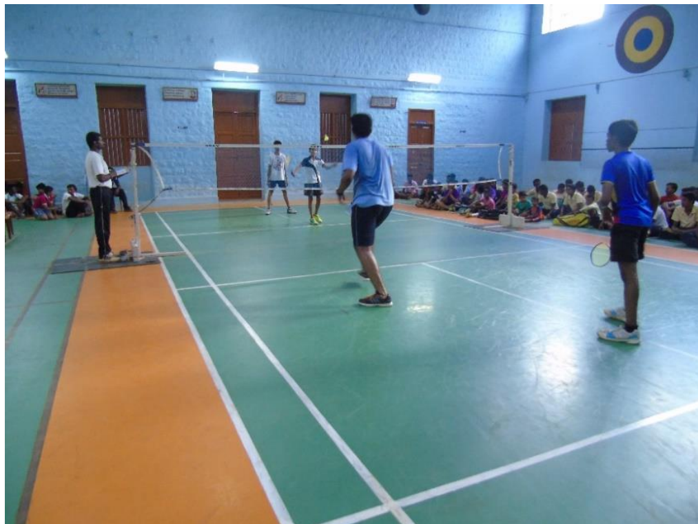
Badminton Summer Coaching camp for school children from 20.04.2019 to 30.05.2019