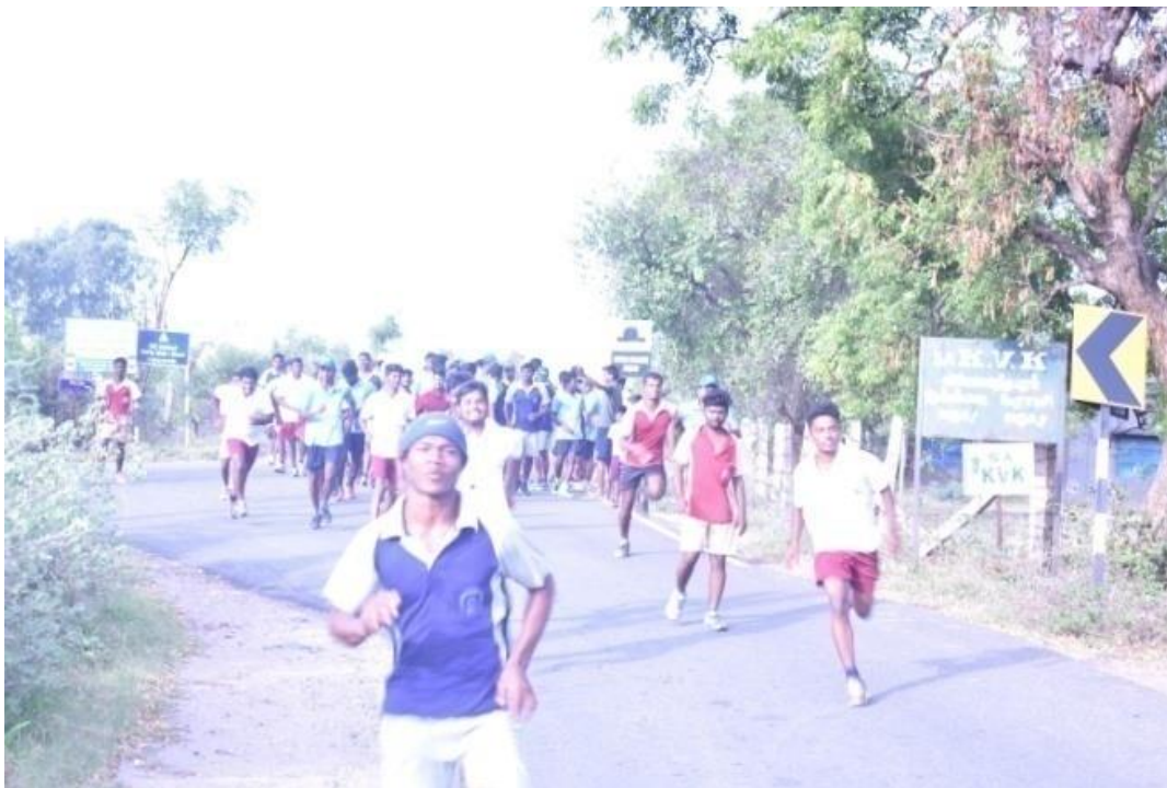
Teacher trainees are participating in the cross country activity at the leadership training camp on 18.09.2018