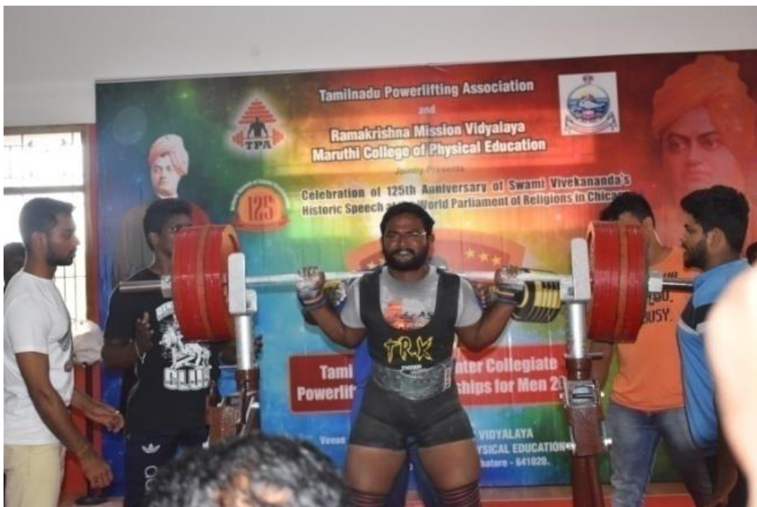
Participants in Action in the Tamil Nadu State 1 st Inter- Collegiate Powerlifting Championship (Competition) for Men on 16.12.2018