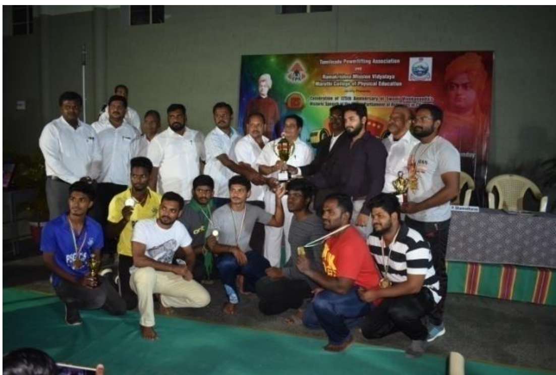
Valedictory Function of Tamil Nadu State 1 st Inter- Collegiate Powerlifting Championship (Competition) for Men organised by SRMV Maruthi College of Physical Education, Coimbatore on 16.12.2018