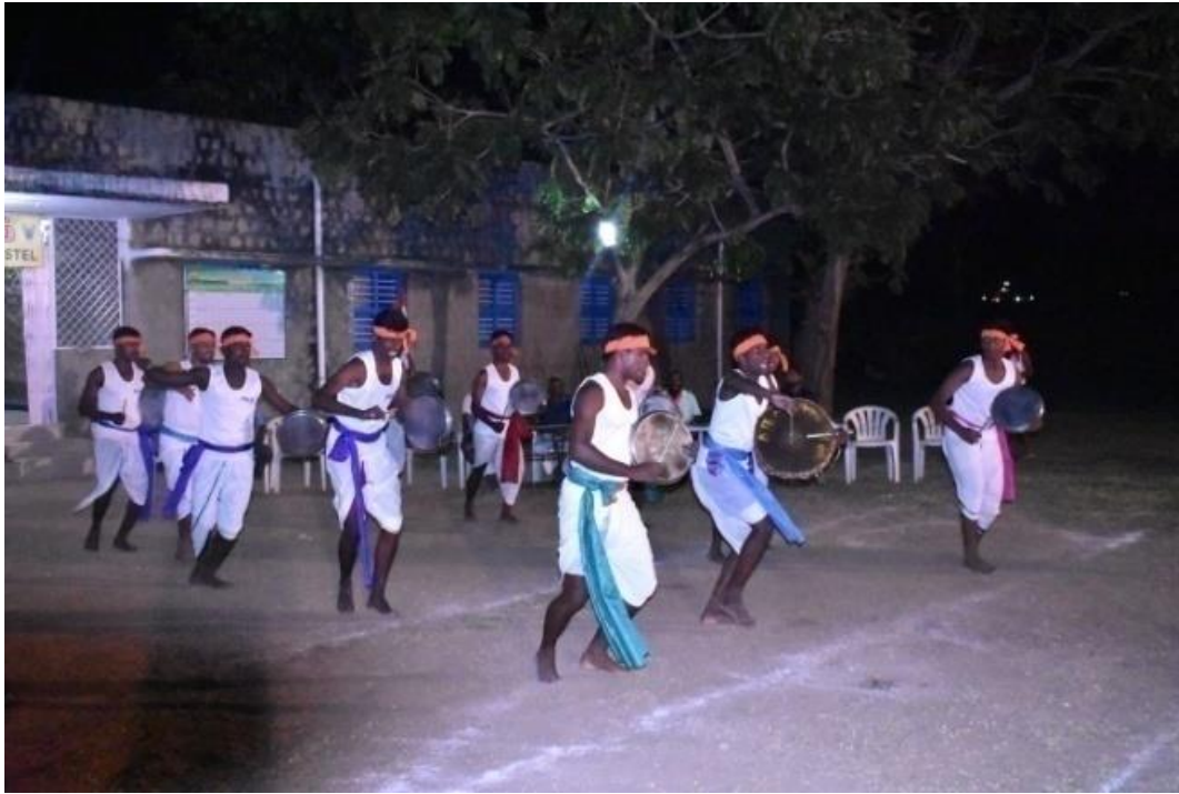
Teacher trainees are performing Cultural activities in the leadership training camp on 19.09.2018