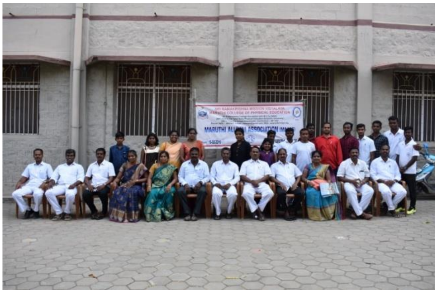
Group Photo of Alumni Meeting