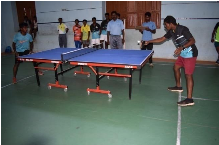
Tamil Nadu Physical Education and Sports University Inter Collegiate Tournament in Table tennis from 03.09.2018 to 07.09.2018