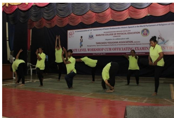
Yogasana demonstration by the teacher trainees