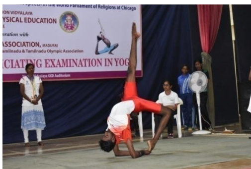
Yogasana demonstration by teacher trainees