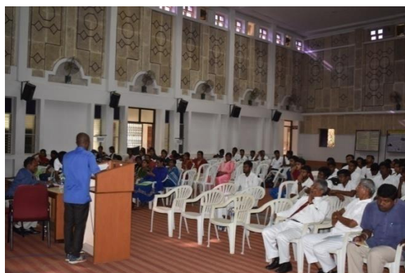
Participants during paper presentation session