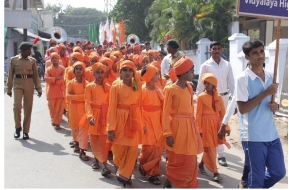
Students during the National Youth Day Rally