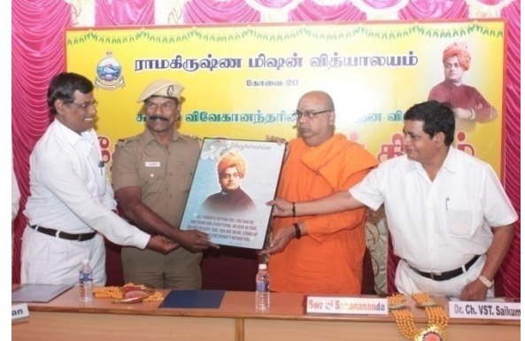
Inaugural Function of National Youth Day Celebration on 10.01.2020