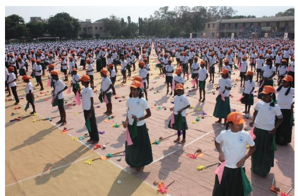
Performing Oyilattam (Folk Dance) by School Children in the Play Festival on 14.02.2020