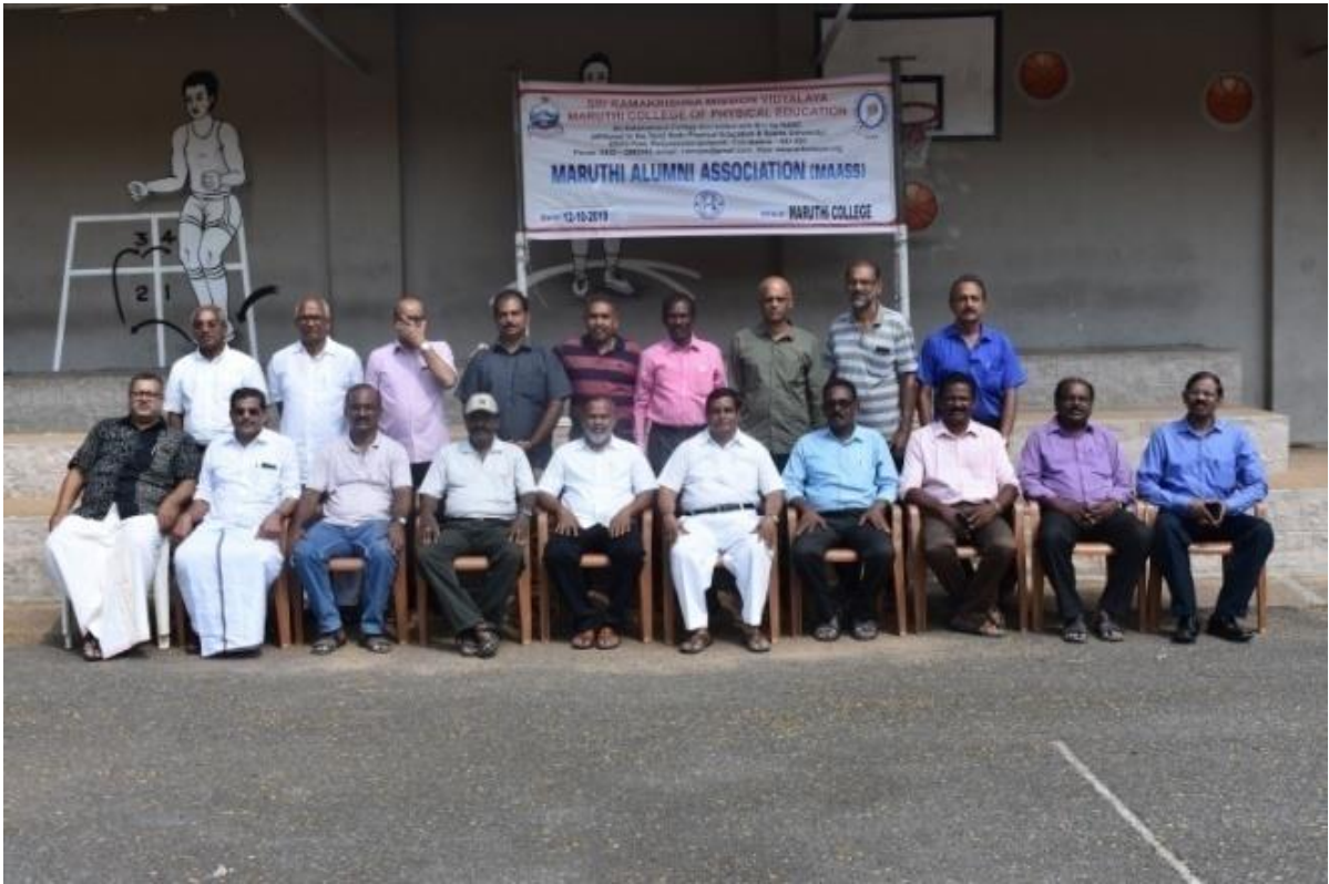
Group photo of Alumni of 1984-1985 batch at our college on 12.10.2019