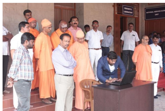
Assessment of gait analysis during the occasion on 24.01.2020