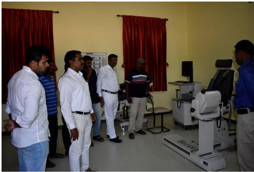
Alumni of visiting Iso-kinetic laboratory at our college on 02.02.2020

Around 16 Alumni with their family members participated in the meeting.