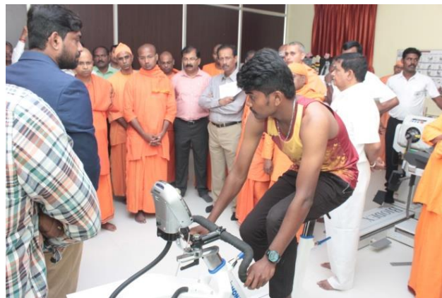
Assessment of quartericeps muscles' strength and VO 2 Max in the laboratory on 24.01.2020