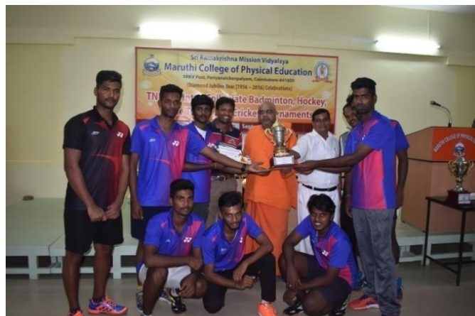
TNPESU Inter collegiate tennis tournament and presenting trophies to the winners of Badminton tournament on 18.09.2019