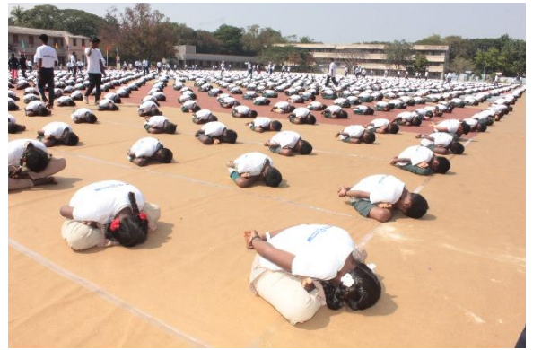
Performing Yogasana by School Children in the Play Festival on 14.02.2020