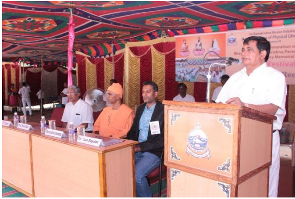
Inaugural Function of Play Festival on 14.02.2020