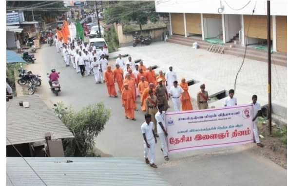
National Youth Day Rally on 10.01.2020