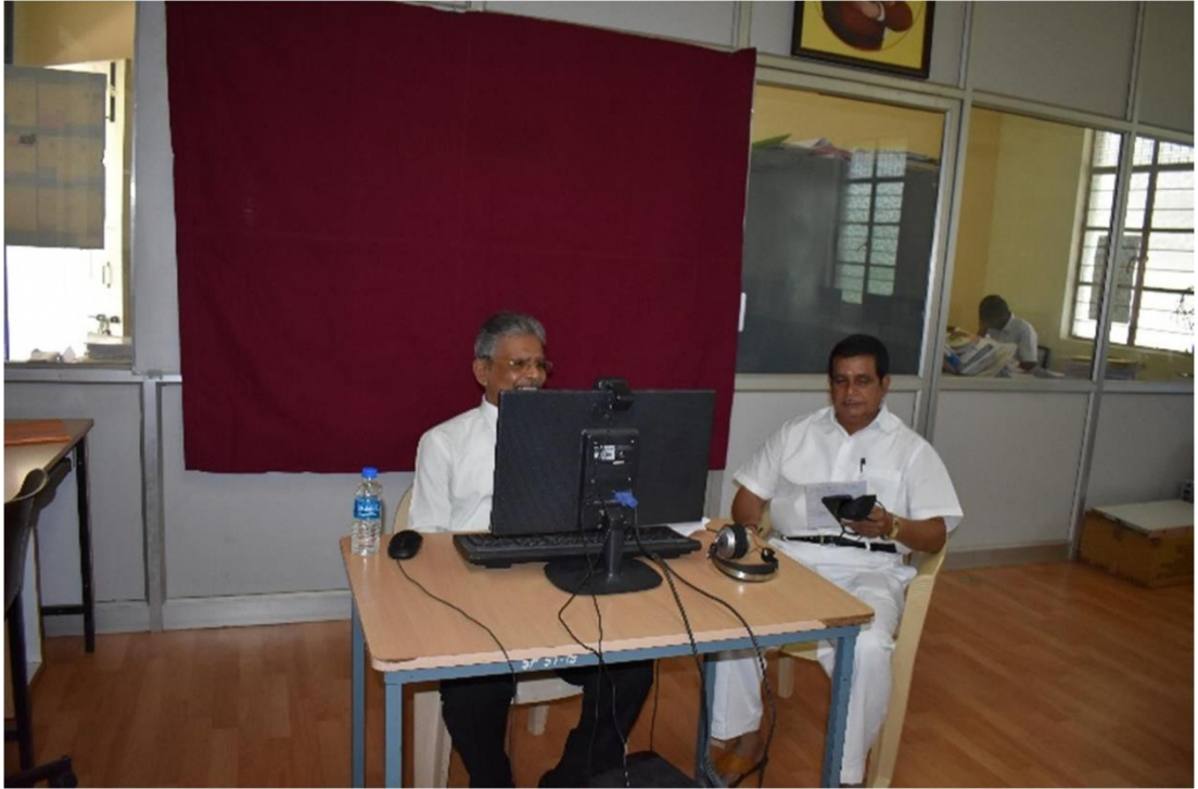
Webinar Photos – Resource Person