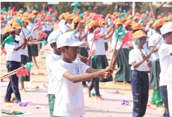
Performing Flower Stick Drill by School Children in the Play Festival on 14.02.2020