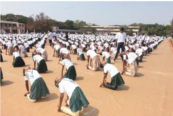
Performing Yogasana by School Children in the Play Festival on 14.02.2020