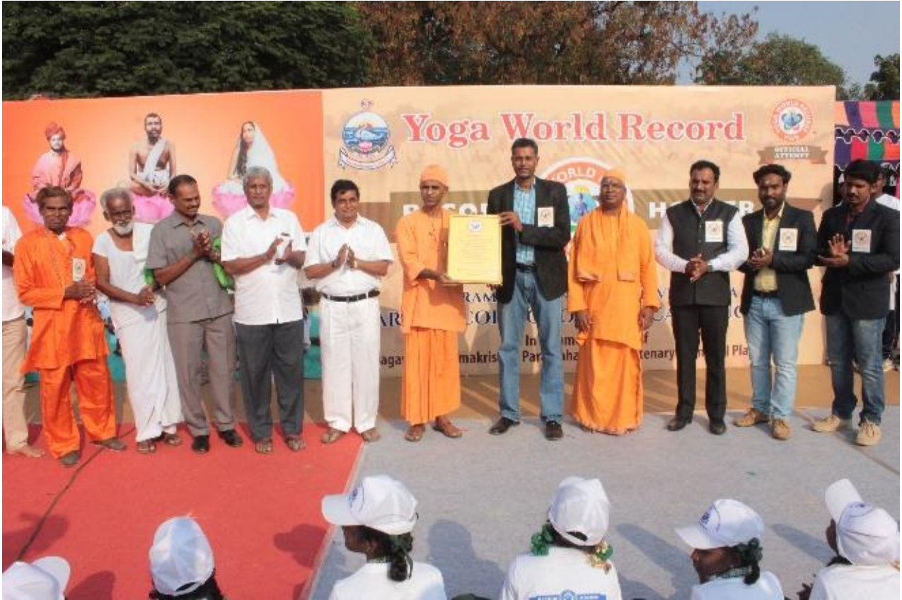
Receiving Yoga World Record Certificate in the Play Festival on 14.02.2020