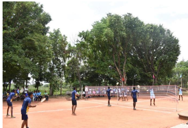
Inauguration of TNPESU Inter collegiate Ball badminton tournament on 16.09.2019