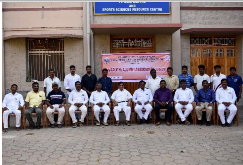
Group photo of Alumni during the Alumni meet at our college on 02.02.2020