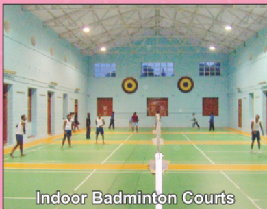
Indoor Badminton Courts