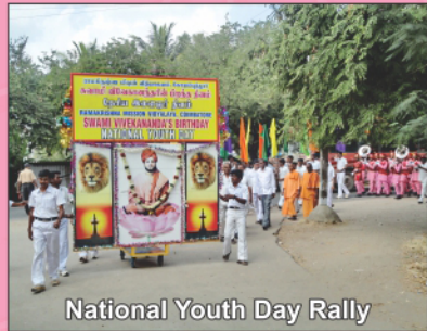
National Youth Day Rally