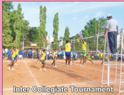
Inter Collegiate Tournament