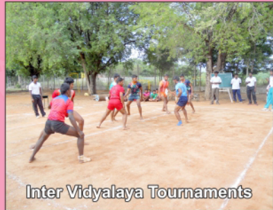
Inter Vidyalaya Tournaments