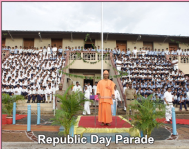
Republic Day Parade