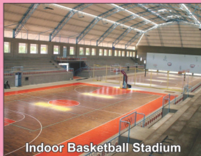
Indoor Basketball Stadium