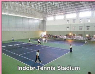
Indoor Tennis Stadium