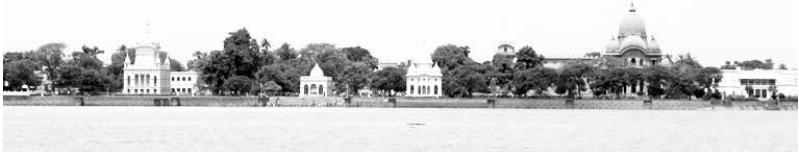
HEADQUARTERS: PANORAMIC VIEW FROM GANGES

RAMAKRISHNA MATH AND RAMAKRISHNA MISSION: Ramakrishna Math and Ramakrishna Mission are twin organizations forming the core of a worldwide spiritual movement (known as Ramakrishna Movement or Vedanta Movement), which aims at harmony of religions, harmony of the East and the West, harmony of the ancient and the modern, spiritual fulfilment, all-round development of human faculties, social equality, and peace for all humanity, without any distinctions of creed, caste, race or nationality.